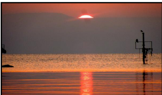
Sunrise at the Sea of Galilee

Payment of deposit by tour participants indicates acceptance of all above terms and conditions, payment schedule, and cancellation policy.